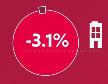
Overall decrease in turnover for SMEs